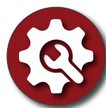
Work Order Tracking and Repair Status