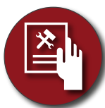
Online Service Requests