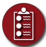
Inventory Data and Service Histories