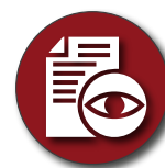
Statistical Summaries and Customizable Reports